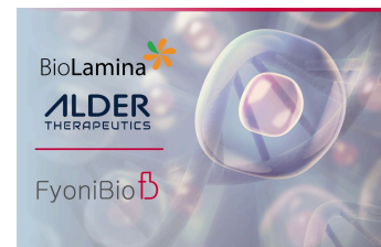
FyoniBio with BioLamina & Alder