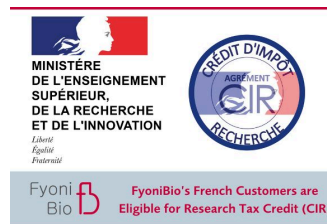
FyoniBio gets CIR (Research Tax Credit)